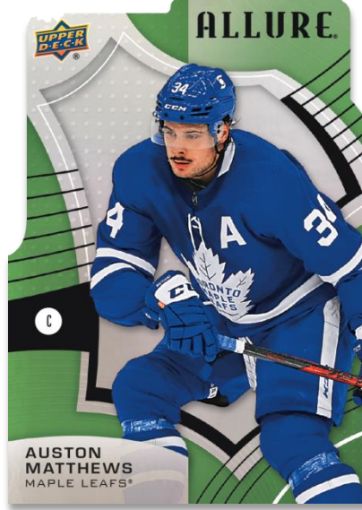
BASE SET Green Rainbow Die-Cut Parallel