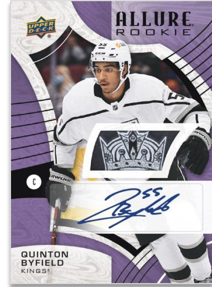
BASE SET ROOKIES Purple Diamond Auto Patch Parallel

2021-22 Allure® sports a 150-card Base Set featuring veterans and rookies - the latter falling 1 per pack , on average.